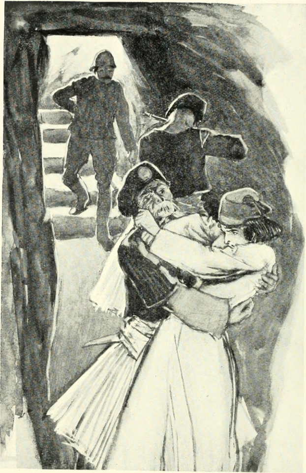
A SHOT WHISTLED BY ME.